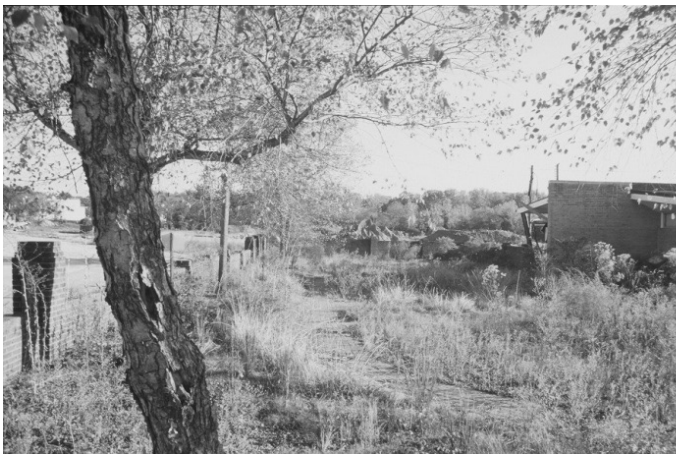
Figure 2. Walled Garden and "Temporary Cemetery" at Chattahoochee Brick Company. Site dates to the 1960s.

Evidence of the terrible labor practice at CBC today is scant. However, we did unearth first evidences of Mr. Smith's claim in Atlanta Sanborn maps dated 1907 and 1909, the first of which indicated the location of three parallel "tenements" at CBC, so they were harmlessly called. 8 (Ill. 1) As we came to understand, two of these were for black convicts, and the third, the smallest of the three, was for whites. Another "tenement" was also outlined, a forecast of the buildup of convict labor preceding the company's ramped up production of brick as the inevitable end of neo-slavery became apparent to all. By the year 1909 the buildings had been eradicated from the map thanks to the convenient Sanborn paste-ins regularly used to update the insurance record. Further evidence arrived in the cache of brickyard working drawings that my students and I salvaged from the Plant Superintendent's office as the complex was being demolished only months