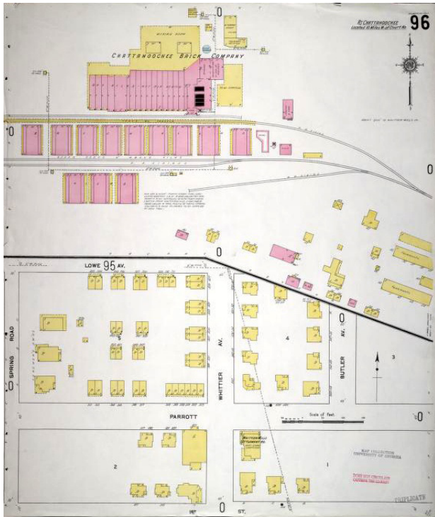
Figure 1. Sanborn Map, Atlanta, GA, 1907, V. I, p. 96